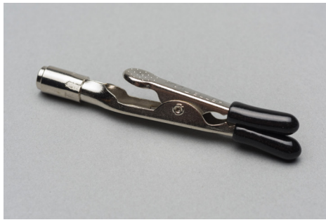
Alligator Clip Device Holder, Pack of 5