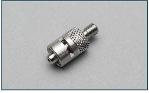
Cassette Device Holder (Luer Lock - 316SS)