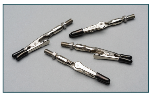
Cassette Device Holder (Clip type)