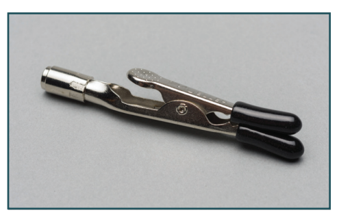
Load Cell Specimen Holder (Clip type)